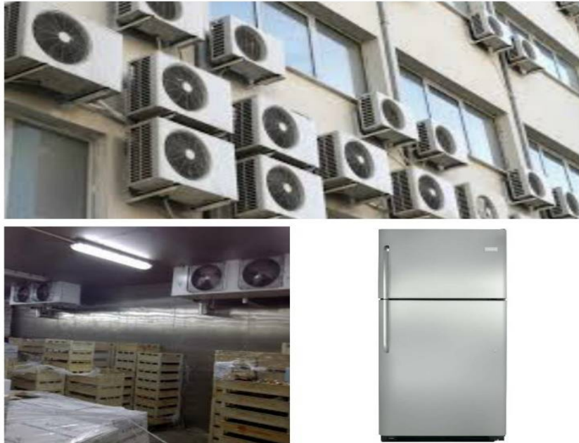
Fig.3 Images of air conditioner, refrigerator and cold storage.